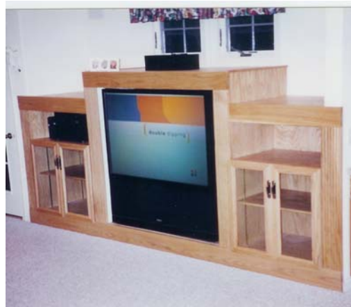
Custom Oak Built-in

Timberline Woodcraft can discuss with you the size and style of the room that will house the built-in, your preference of woodworking style, your budget, and the time frame for finishing your custom designed built-ins.