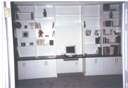
Timberline Woodcraft Design