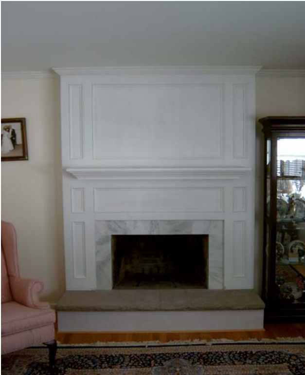
Hardwood painted fireplace surround with marble accent and limestone hearth

Timberline Woodcraft is known for the enduring elegance of our fireplace surrounds. We can uniquely design a magnificent fireplace surround in select hardwoods to add detail to any existing fireplace. Fireplace surrounds add character and depth to your room while displaying your unique taste and style. Our designs offer unsurpassed beauty to your residential or commercial project.