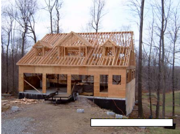
Carriage House Framing

Our construction division can also build out buildings to add to your storage or living space. The carriage house below added 3,000 sqft of storage/living space, which also included a pool changing area on the back lower floor. Notice the custom barn type doors on the finished picture. Our skilled craftsman can supply and install any type of doors to your home whether replacing old doors or incorporating them into your new addition.