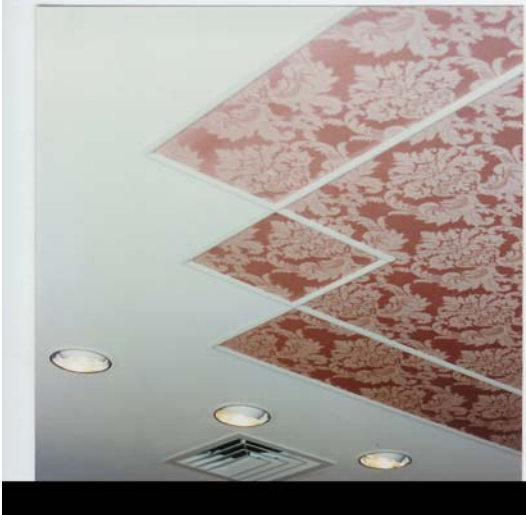
Accent moulding on ceiling

Wainscoting, picture frame moulding, or new hardwood railings will increase the beauty of any home and add value for years to come.