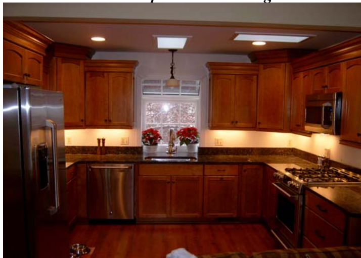
New Honey Maple Kitchen with Granite counters