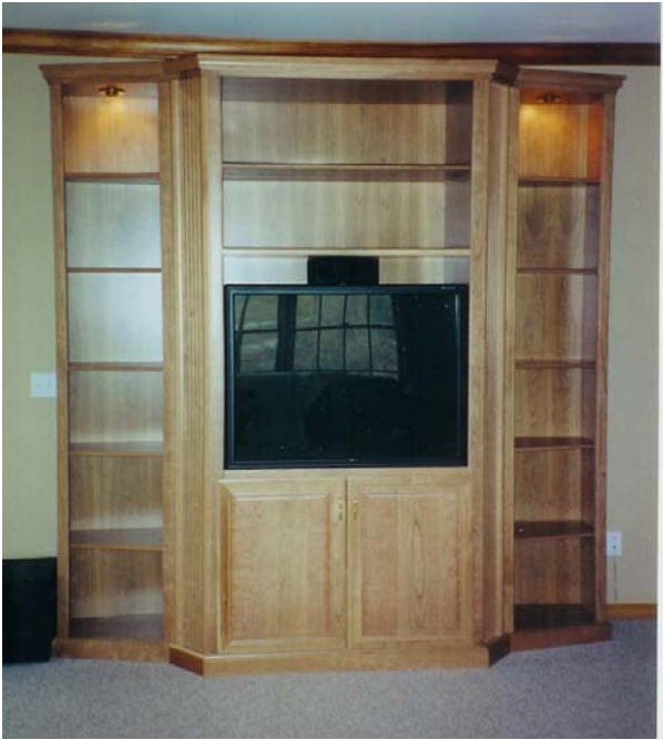
Custom Cherry Built-in

Timberline Woodcraft specializes in high quality handcrafted built-ins to fit your home, décor and lifestyle without sacrificing the comfort and functionality you require. One of the best ways to enhance your living space is in the form of a custom built-in specifically designed for your home.