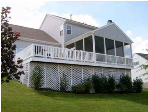
Screened in Porch/Deck