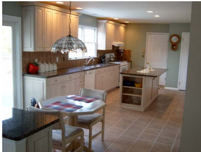
New White Washed Maple Kitchen with granite counters

Every installation by Timberline Woodcraft is made to the customer's specification. Our installations will last for generations if cared for properly.